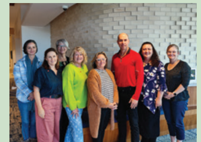
Our first cohort of peer mentors from June 2023 training day.

A Peer Mentor Training Guide was developed which is provided to each Mentor in Training prior to training day for review and completion. This training guide attends to core mentoring skills and guides the Peer Mentor Training sessions, the first taking place in June 2023 with eight participants. New Peer Mentors continue to engage in mandatory monthly supervision via Zoom. To date training has been undertaken in person and plans are underway to develop a virtual training program to ensure any bereaved parent can engage in training regardless of their location in Australia or other life commitments.